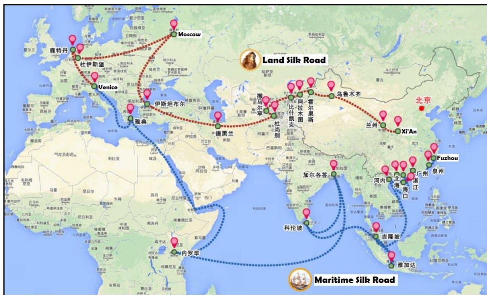
PICTURE 1. The Silk Road Economic Belt and the 21 st Century Maritime Silk Road.

In autumn 2013 the freshly-elected Chinese leading duo formed by President Xi Jinping and Premier Li Keqiang made a historic debut in the international arena. Two ambitious foreign policy initiatives were announced with the goal of changing the face of the Eurasian continent by creating a thick web of connections on its lands and on its seas. Just as the famous Silk Road used to do at the time of the ancient civilizations, this network would be meant to open a new phase of prosperity and peace for Asia, Africa and Europe by pushing them towards closer economic integration, cooperation in policy areas like security and people-to-people dialogue.