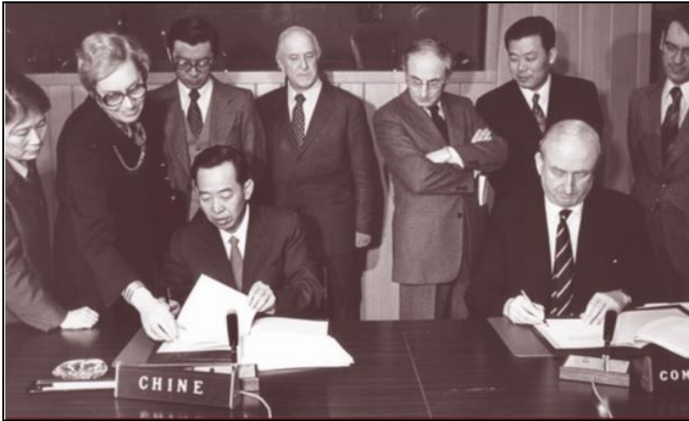
PICTURE 4 Official establishment of diplomatic ties between the PRC and the EECs.