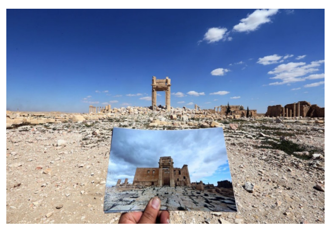
Figure 1: A photographer holding a picture of Palmyra's Temple of Bel in front of the reamins of the temple after it was destroyed by ISIS in September 2015.

Therefore, the illicit trade in cultural goods is not, in any case, a harmless crime. Indeed, the loss of cultural objects is a tangible and intangible phenomenon which has tangible and intangible consequences. The destruction and lootings of cultural perpetrated by the ISIS are a prime example to explain this concept: not only were the stolen or devastated items items irreplaceable, but those also